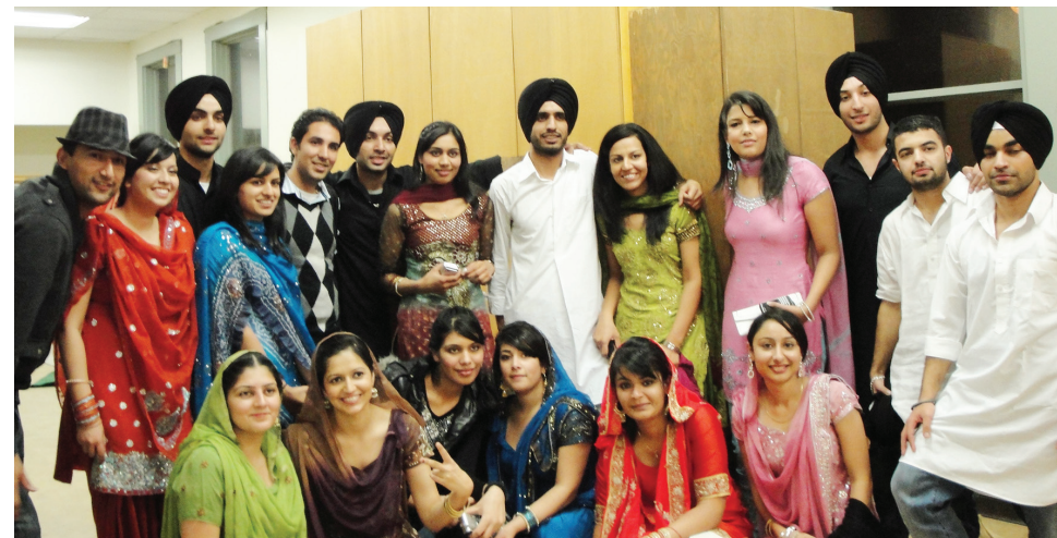
UFV's giddha team performing (left) and UFV's Bhangra Team after a performance (right).