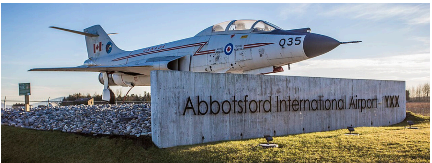
Abbotsford International Airport