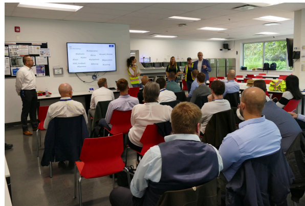
Students visit Garaventa Lift