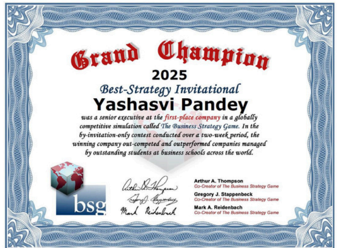
BSI Grand Champion Certificate