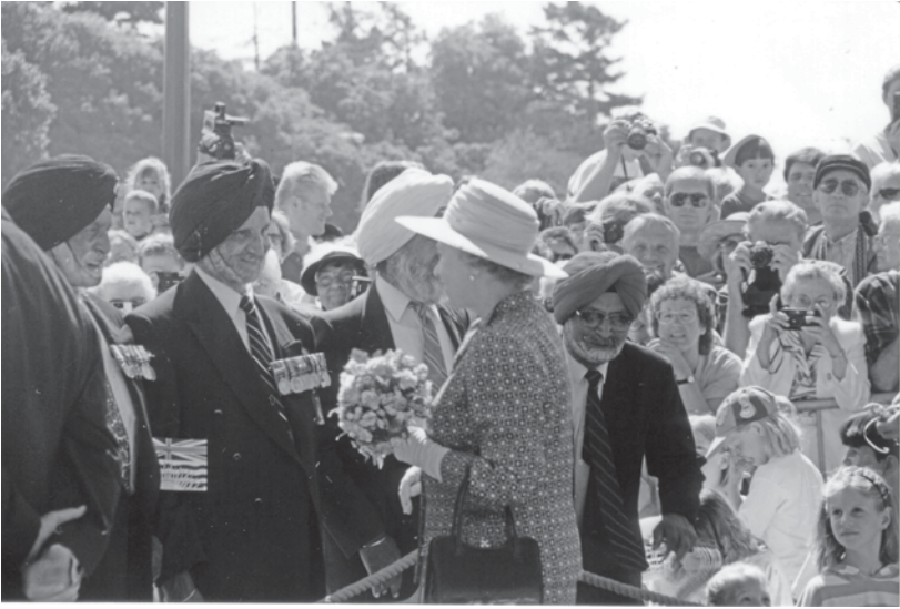
Pritam in conversation with Queen Elizabeth II in 1994.