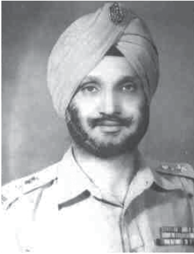
In CRP Uniform and as Commandant of the No.1 Signal Battalion Central Reserve Force at Jaroadha Kalan, New Delhi in Police uniform in 1974.