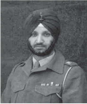
In Major's uniform while serving in No. 5 Infantry Division Signal Regiment at Jalandhar (Punjab) as No. 2 Company Commander during 1956.