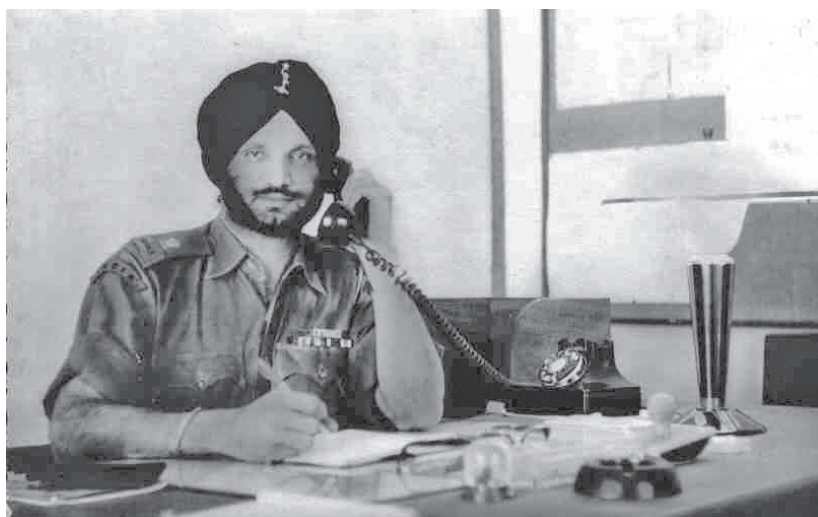
As a Major in Vietnam, 1961.