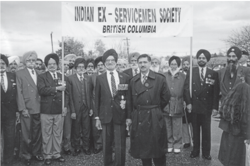
As President, Indian Ex-Servicemen Society of British Columbia, Canada carrying the Society's banner during a Remembrance Day Parade at Whalley Legion, Surrey, British Columbia, Canada in 1996.