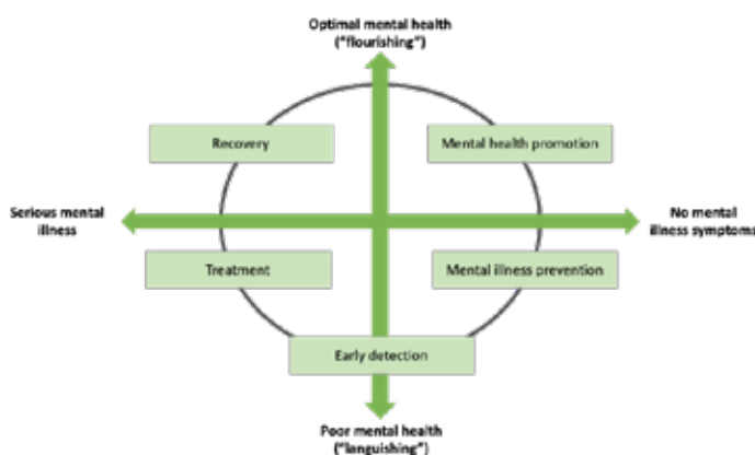
Figure 2. Mental Health Service Continuum within the Keyes' Dual Continuum

In 2016, Jaworska and colleagues conducted a cross-sectional survey of over 168 publicly funded Canadian post-secondary institutions regarding their campus mental health services 10 . The results of this study indicated that the most frequently offered services and supports at institutions included mental health promotion services (73%) and counselling/treatment services (91%), with much less focus laid on mental illness prevention, early detection, and recovery.