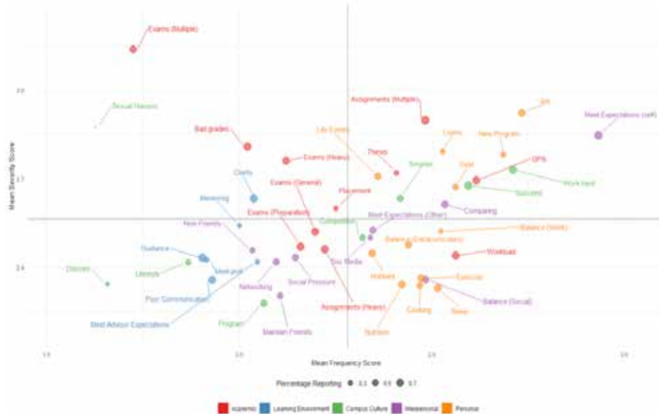
Figure 3. Example of Distribution of Stressors on PSSI at a Canadian Post-Secondary Institution

culture, interpersonal stressors, and personal stressors. This tool was created over the course of two years by students, for students, through a combination of open-ended, online survey responses, focus groups, and individual interviews 9. The PSSI is delivered as an online survey, where respondents are invited to rate each stressor by severity and frequency of occurrence. Stressors can then be easily plotted by average severity and frequency on a simple 2x2 graph that can assist institutions with determining the areas most in need of improvement on their campus. As not all campuses are created equally, the PSSI is a useful tool for assisting institutions with improving the tailoring of mental health promotion and mental illness prevention services and supports.