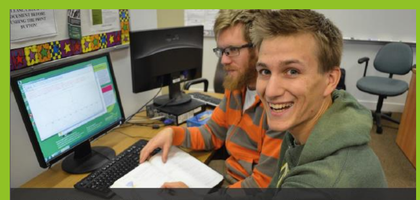
UFV Math & Stats Centre promotes mathematics and statistics, and offers student employment.

The Math & Stats Centre is a great place for students to study mathematics and statistics individually or in groups, and get help from a faculty member or a student monitor.