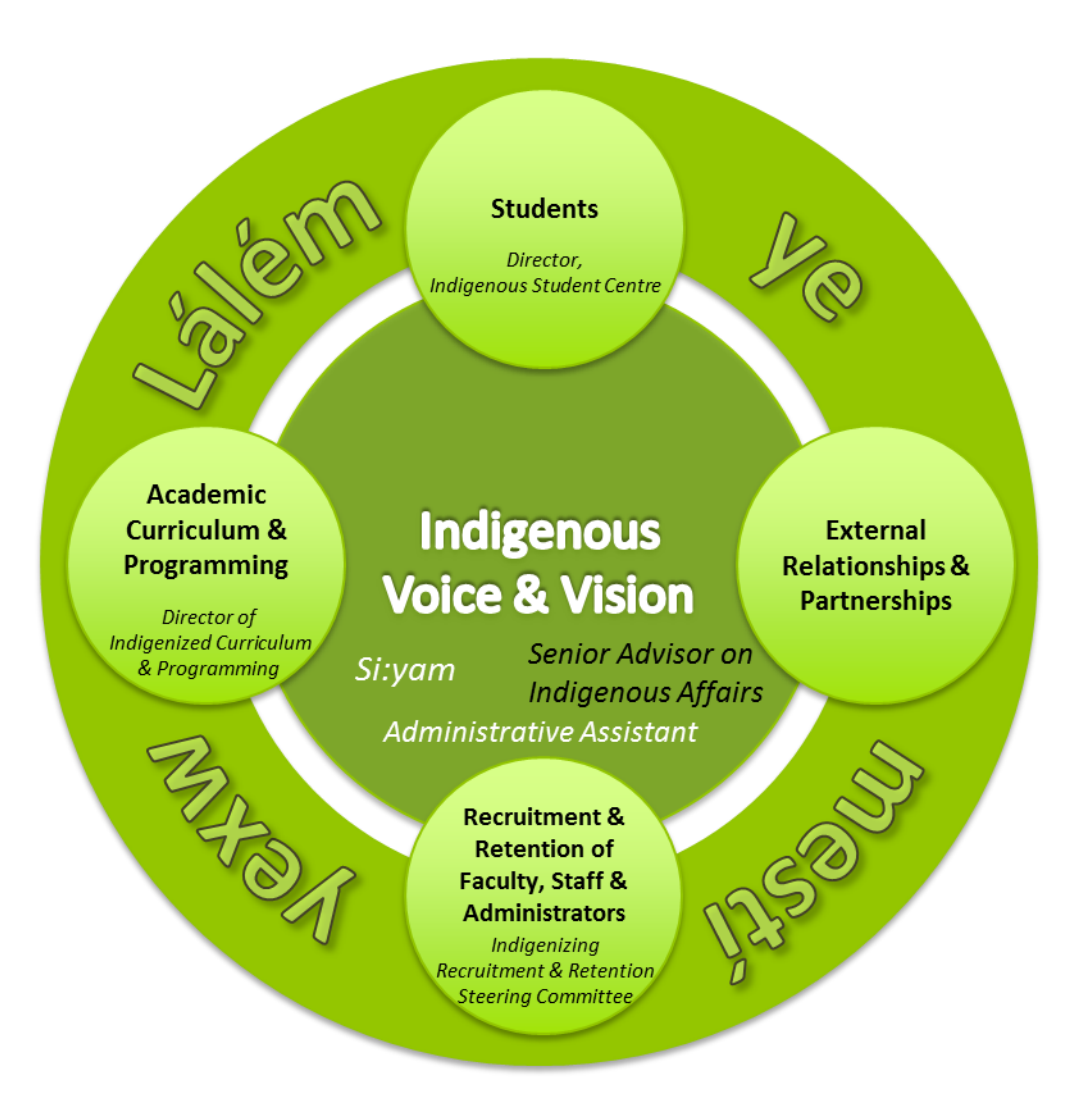
Diagram 2: Circles of Indigenization

Academic Curriculum and Programming encompasses the development and delivery of curriculum (courses and programs) and programming (events, workshops and professional development activities). As conceived in response to the Truth and Reconciliation's Calls for Action, they are designed to educate, build awareness, and develop capacity for Indigenization and Reconciliation at UFV. Responsibility for development and delivery of these activities is shared by the departments, schools and interdisciplinary programs across all Faculties. The Teaching and Learning Centre, including through the new position of Teaching and Learning Specialist (Indigenization Speciality) and the Senior Advisor on Indigenous Affairs, offer support and guidance, as resources allow. The Indigenous Studies Curriculum Committee (ISCC) is mandated with the development of Indigenous Studies curriculum and programming at UFV, as well as maintaining communication between the various academic units on curricula.