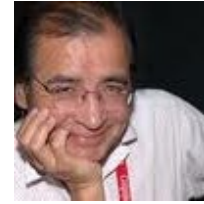
Writer, Tomson Highway to visit UFV

Leave a voice message: 604-851-6346 for prompt reply